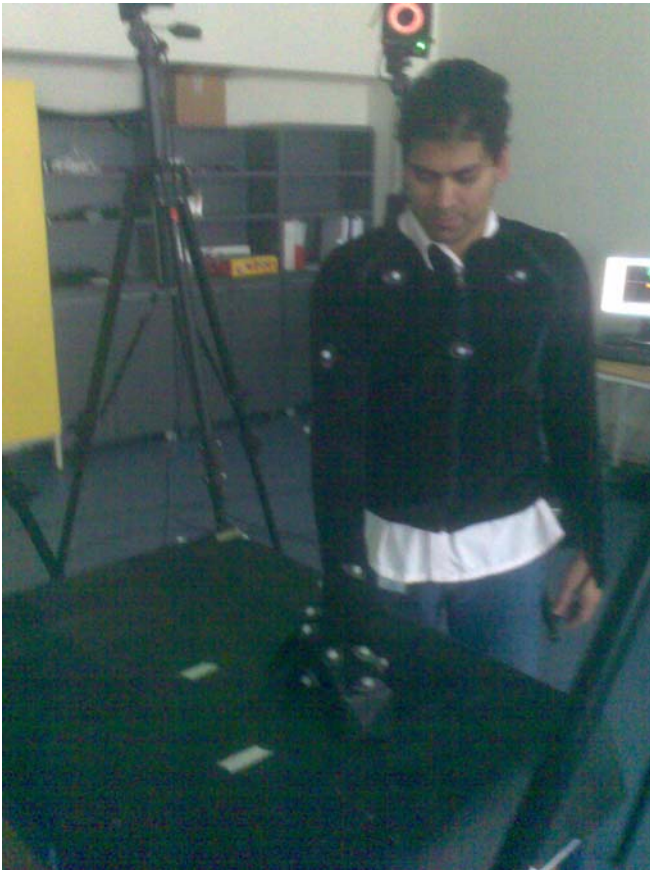
Fig. 1: The experimental setup showing the marker positions.

Therefore we look at the spatial variation to determine the placement of the Gaussians. We look at the arc length of the trajectory to determine if we have enough spacial variation to form a Gaussian. This way we avoid building a Gaussian that is too small. Our approach is outlined in Algorithm 1.