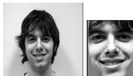
Fig. 2 Face extraction in the visible spectrum.

For face learning and recognition, we extract face regions for further processing. In the visible, NIR and SWIR spectrums, face images are extracted using the alignment technique proposed in [11] (Fig. 2).