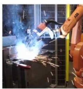
(b) welding in operations