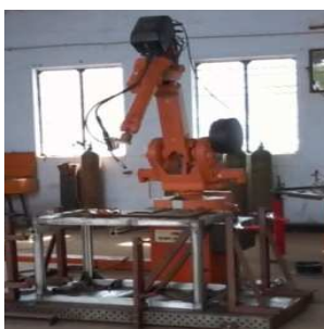
(a) Welding machine

Bead-on-plate welding trials were conducted using an ABB MIG Robot 500 with IRC 5 controller welding system is presented in Fig.1(a and b).