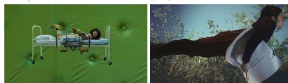
Fig. 5 Flying

Flight to the sky, an ability that humans don't possess, symbolizes freedom. In I'm a Cyborg, but That's OK , Yeong-gun happens to escape from a solitary cell at a psychiatry ward to meet the deceased grandmother who he has been missing. This scene is used as a means to escape from the confined reality.