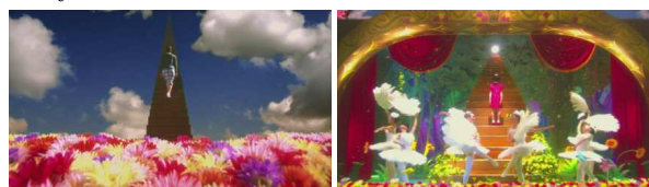
Fig. 3 Stairs in Memories of Matsuko

In this film, stairs are most directly connected to its theme. they are objects of love and hate in earlier parts, but are changed into the meaning of guidance to forgiveness and love. The film contains some intended cuts of stairs to make them look high and long by taking them at low angles, which seem as if the way to forgiveness appear distant and high. In addition, featured in lights, the end of stairs means the way to approach God.