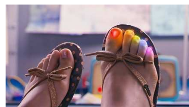
Fig. 17 Toes as recharge indicators in I'm A Cyborg But That's OK

In I'm a Cyborg, but That's OK, the heroine expresses her full charge as the light turning on at her foot fingers. This is also an