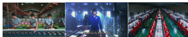
Fig. 21 Uniform Camera Movement

The camera makes vivid the cuts of group working with mechanical feeling by using the front shot and right-left/up-down cranking. The plant scenes in Citizen Dog, and I'm a Cyborg, but That's OK show quite similar atmosphere, which contain earlier aspects and situations before the main characters find their loves. Memories of Matsuko expresses the situation in which Matsuko is jailed, with regular rhythms among cuts in the form of music video.