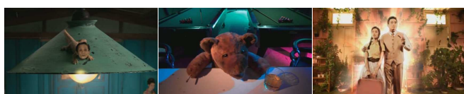
Fig. 8 Movement of non-living objects in Citizen Dog

Matsuko sings songs when she is happy. While she is singing, things are allowed to move to have life. Also, her sorrow is maximized by making fairy tale like even in her cruel situations.