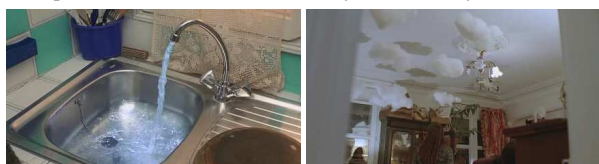
Fig. 10 Transformation of material in The Science of Sleep

Some exotic materials are used to express fairy tale like pureness. For example, in The Science of Sleep, the two main characters' imagination expressed as cellophane paper, water, cotton, and clouds in the space of reality plays the role of forming sympathy between them.