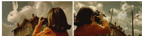
Fig. 11 Transformation of material in Amelie of Montmartre

Some exotic materials are used to express fairy tale like pureness. For example, in The Science of Sleep, the two main characters' imagination expressed as cellophane paper, water, cotton, and clouds in the space of reality plays the role of forming sympathy between them.