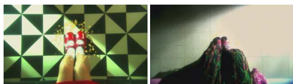
Fig. 18 Expression of emotion through feet movement in Memories of Matsuko

expression of a mechanic human being, and shows that the machine is charged with batteries while the human being gets energy from food. This metaphorically presents the state of the heroine, Yeong-gun.