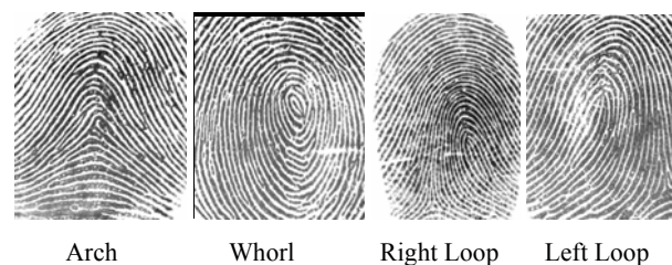
Fig. 1 Four major fingerprint classes

However, left loops, right loops and whorls are the most popular types and nearly 94% of fingerprints are in these classes [3]. So, we believe that four classes of left loop, right loop, whorl and arch are the major classes for fingerprint classification. Fig. 1 shows an example of four classes.