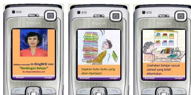
Fig. 2 Content services on the application of m-NingBK ©: "Learning Guidance"

ICT applications content that have been developed as shown by Table I.