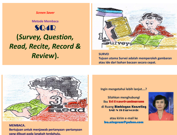
Fig. 3. Some displays of Screensaver "Learning Guidance"

Based on this, the author is aware of the problems in learning, resulting in the lowest point assessment. Through these research activities are expected students to have insight and a better career preparation. Table 2 shows the GC Action research and Fig. 4 shows the frame of mind in the research conducted.