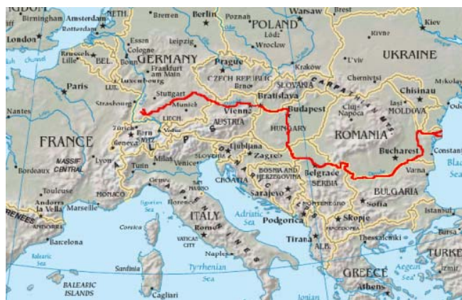
Fig. 1 Map of Danube River

originates in the Black Forest in Germany as the much smaller Brigach and Breg rivers which join at the German town of Donaueschingen. After that point it is known as the Danube River and it flows southeastward for a distance of some 2850 km, passing through four Central and Eastern European capitals, before emptying into the Black Sea via the Danube Delta in Romania and Ukraine. This river flows through or acts as part of the borders of ten countries: Germany (7.5%), Austria (10.3%), Slovakia (5.8%), Hungary (11.7%), Croatia (4.5%), Serbia (10.3%), Bulgaria (5.2%), Moldova (1.6%), Ukraine (3.8%) and Romania (28.9%) (The percentages reflect the proportion of the total Danube basin area, shown on the Figure 1. Major cities along the Danube include the three national capitals of Vienna (Austria), Budapest (Hungary) and Belgrade (Serbia). Along its course (Figure 1), the Danube is a source of drinking water for about ten million people. But most states find it difficult to clean the water because of extensive pollution.