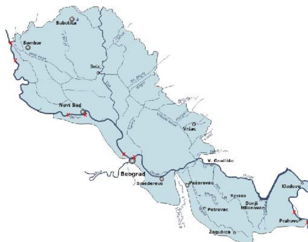
Fig. 2 Sampling locations from Danube River in Serbia

We took water samples from eight different locations along the course of Danube River (Figure 2), during December 2010. All samples were prepared according to ASTM Standard Test Method [4]. Each water sample was filtered through a slow depth filter and then distilled. After the distillation, the samples were mixed with the scintillation cocktail Optiphase HiSafe 3.