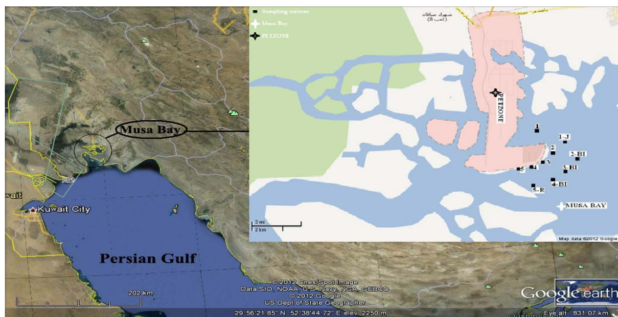
Fig. 1 Sampling stations in the Musa Bay

Open Science Index, Environmental and Ecological Engineering Vol:7, No:3, 2013 publications.waset.org/12219.pdf