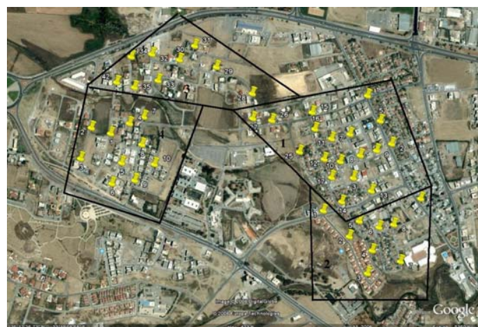
Fig. 2 Divided districts of Nicosia Municipality

The present system could be viewed as a network with undirected arcs and nodes. Every arc has a weight attached to it, and it is often possible to get from one node to another in more than one ways. Thus, if there are n nodes in a network, there must be at least n-1 arcs that are needed to connect all the nodes with one another. The basic algorithm that will be used over here is as follows: