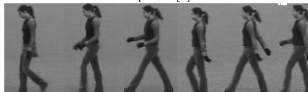
Fig. 2 Sample images from multiple frames of a single person's walking sequence [2]