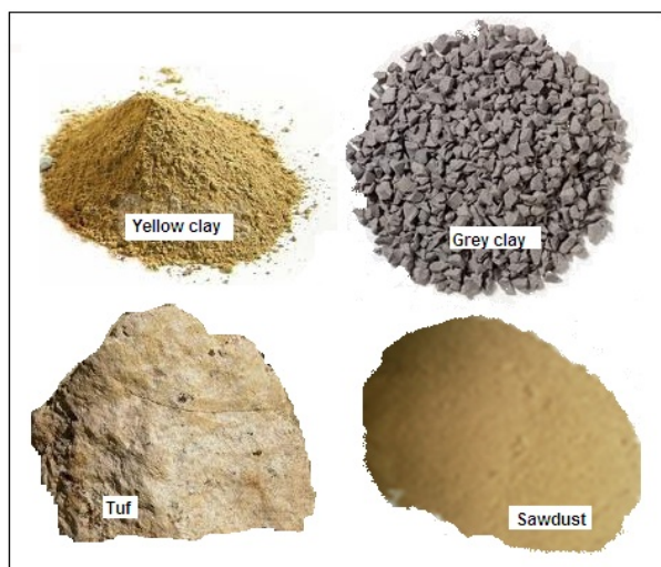
Fig. 1 Raw material

Sawdust and clay used in this study is categorized as Eucalyptus and Pine Alep-Mixed in terms of their particle sizes. Fig.1 shows the raw materials used in the fabrication of bricks samples.