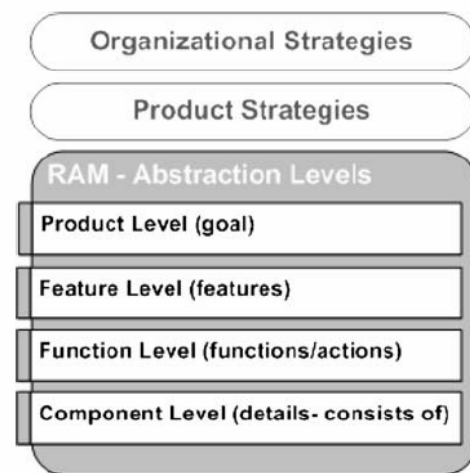
Fig. 1 Requirements Abstraction Model (RAM) Abstraction Levels [7]

The last level in the RAM model is the Component Level. Requirements at this level have detailed information. Component level requirements generally describe how a problem is to be solved. An example of the component level requirement from the CMS system is "If the user enters an incorrect user id and /or password the login page shall be reloaded with information showing that an incorrect login has been attempted".