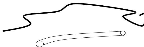
Fig. 2 The thread deforming in a three-dimensional space and its idealization as a one-dimensional rod-like structure.

The finite element meshing can be adjusted to emphasize the type of output desired. Meshes can be static (i.e. meshes that do not change), dynamic (i.e. changing meshes) or a combination of both. Examples where static meshes can be used are for closure of tissues while dynamic meshes are more appropriate in case of tissue cutting. On the other hand, the mesh needed to discretize the surgical thread must be very fine and the large number of material parameters at each node becomes cumbersome for real-time interactive simulations. One interesting approach to decrease the computation time is by Berkley et al. (2004) [24]. To solve for the deformation of the thread, a classical finite element analysis is implemented but the output is determined on a "need to know basis". The underlying idea is that only a selected number of variables, not all, need to be computed. For instance, it may not be necessary to calculate the displacement at some interior points, nor may it be worthy to know the stress or strain field at these particular points. In the same spirit, reaction forces need to be only computed when the user touches the thread. Real-time aspect of the simulation is even more important when simulation knot formation since a skilled surgeon will be able to tie five to eight knots per minute.