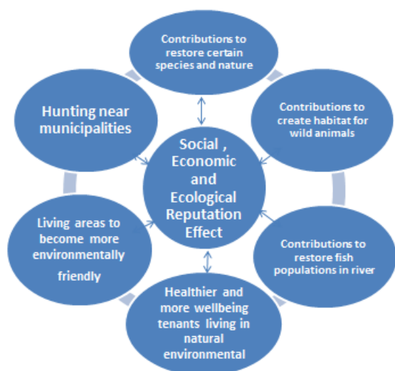
Fig. 3 Regenerative housing area design, SEERE-effect

The community housing company has the opportunity to contribute to municipality value in several ways. The public