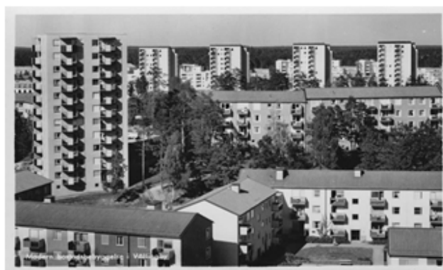
Fig. 1 Vallingby million program area, Stockholm

The “million program” was built in a period where the environmental considerations were low and ideas of man having the right to exploit nature. The architecture was inspired by the architect [1], a modernist who considered dwelling houses to be “machine habited”, machines to live in and meant that rationalism should be guiding every building and city construction project. Vallingby in Stockholm was one of the first million program areas: