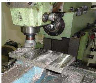
Fig. 1 actual machining operation

The experiments were performed in a Vertical milling machine (Tabriz co.) with a maximum spindle speed of 2500 rpm and 630 mm/min maximum feed rate. The machine had a 4.4 KW spindle motor. The actual machining operation is illustrated in Fig. 1.