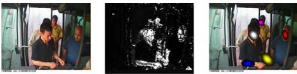
Fig. 1. (a) original image, (b) skin map, (c) five detected objects