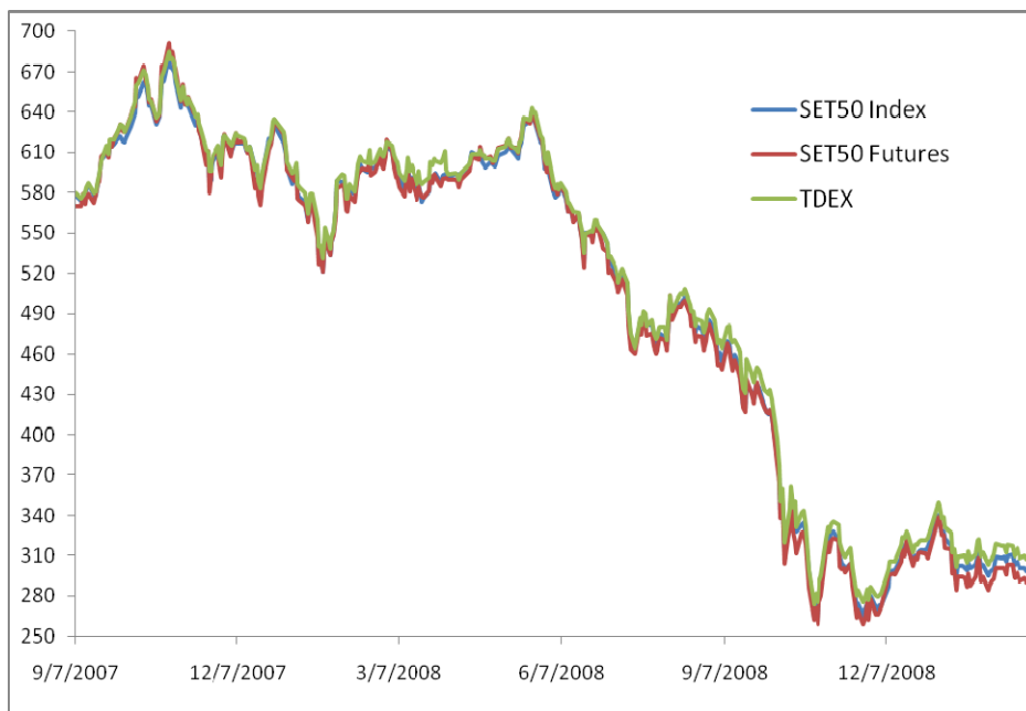
Fig. 2 Time series of the SET50 index, SET50 futures, and TDEX from September 2007 to February 2009