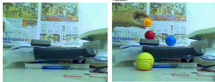
(c) Global search resumes when objects move outside the search space.