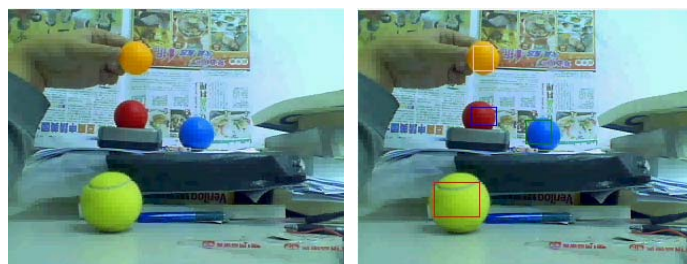
(a) Modeling of the target objects.