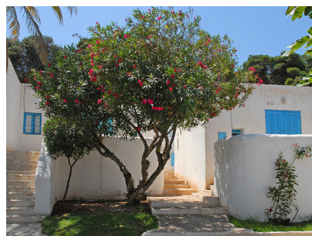
Fig. 3 View of a bungalow

A view of a bungalow is given on Fig. 3.