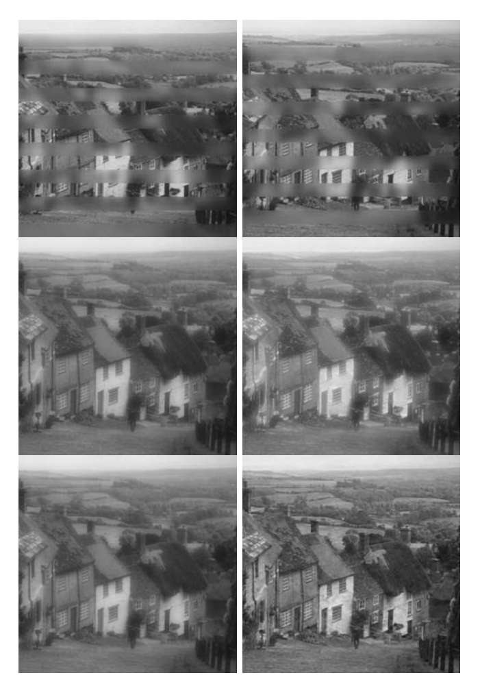
Fig. 1. Fusion results, the original image blurred in stripes. Top row: input image X (one half of stripes in the original image blurred, left), input image Y (other half of stripes in the original image blurred, right). Second row: fused image F using averaging (left), fused image F using ratio pyramid decomposition (right). Bottom row: fused image F using the PCA decomposition (left), fused image F using DWT domain fusion (right)

Test results show that the DWT domain fusion visually outperform the other three schemes. It is most noticeable as, for instance, the blurring (e.g., edges in the background and small details) and the loss of texture in the fused image obtained by the ratio pyramid and averaging. Furthermore, in the ratio-pyramid method fused image, some details of the images and background have been completely lost, and in the average composite image, the loss of contrast is very evident. These subjective visual comparisons agree with by the results obtained by the proposed metric, presented in Table