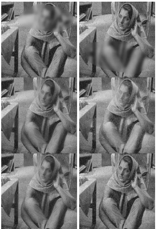
Fig. 3. Fusion results, the original image randomly blurred, with Salt and Pepper noise added. Top row: input image X (left), input image Y (right). Second row: fused image F using averaging (left), fused image F using ratio pyramid decomposition (right). Bottom row: fused image F using the PCA decomposition (left), fused image F using DWT domain fusion (right)