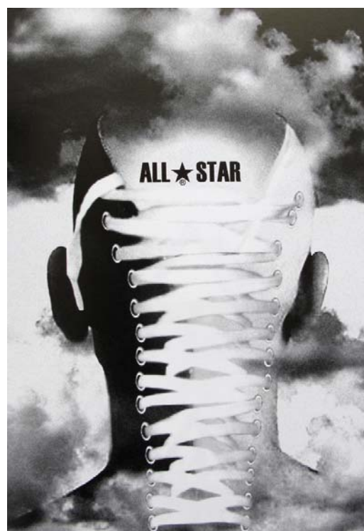
Fig. 1.Ad for sneakers

On the other hand due to the extent of human vision and to visual understanding of people use picture instead of words to transfer messages and broad concepts in the shortest time is very efficient, so picture can improve this basic need in posters, advertisements and brochure.(Fig1-2) Thus photography offering very diverse capabilities and facilities that provide them with conventional methods extremely difficult and sometimes are impossible to learn a world of creativity on the graphic with the help of brief images of photography and composition and combining multiple images, scenes can be exciting and beautiful to watch, witch leaves that viewer with a very strong relationship established make.[1]