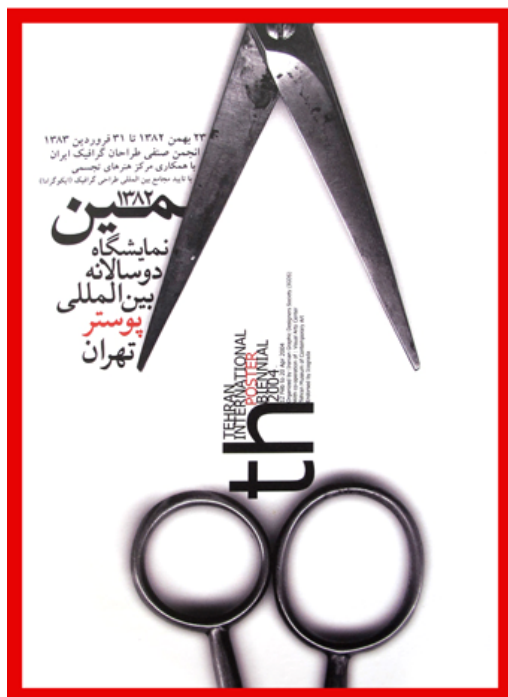
Fig. 3. Maryam Khosravani, 8 th Tehran international poster biennale, 2004, proposed.