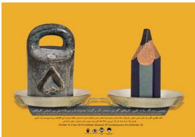
Fig. 2. Poster

Thus photography and graphic help each other to achieve a broad aim and it should be said that using photographs for a graphic artist, is a great advantage. The characteristics and capabilities of photography and images to express ideas with graphic that sometimes is very difficult or not possible for any method to achieve should be considered. It opens a new world of possibilities to the graphic and helps him to realize his goals.