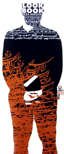
Fig. 9.Reza Abedini, look book, reza abedini book design exhibition,2005.

Photography is a stable source in nature. How photography has been caused to change and expand of human experience. On the other hand conformity with the reality of photographs cause that has been reliable than any other media. Using photo is the easiest and fastest way for graphics like past. In some years as 1986 the use of photography in graphic reached to a peak while it decreased is some decades. In view of the graphics, image that photo is away to achieve a better life and perhaps this is why photo is more appropriate than other subject. (Fig9-10)