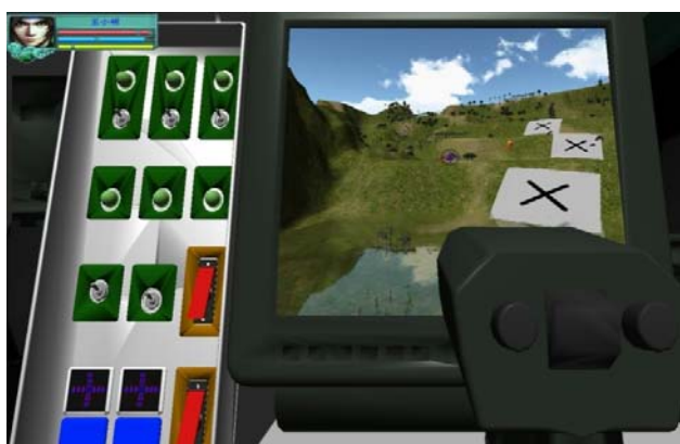
Fig. 2 Game-based training environment

In our research, we want to add enemies in our training game. Learner has their life's degree, if they can't finish of fighting enemies in constraint time. They will be died. Furthermore, in order to enable learner to experience operating method, when each learner started the game, learner must complete the first task before fighting to enemies. So, we designed the simple targets in the scene, and learner must hit the designed targets in the first. If learner completed the simple task, then they can go to next task to fight with enemies. Expecting of fight with enemies can create learner's mental workload. Besides, we also add the timer constrain into the game. Hoping through these game's features of mental contest can increase learners' mental workload. Our game-based training environment as show in Fig.2