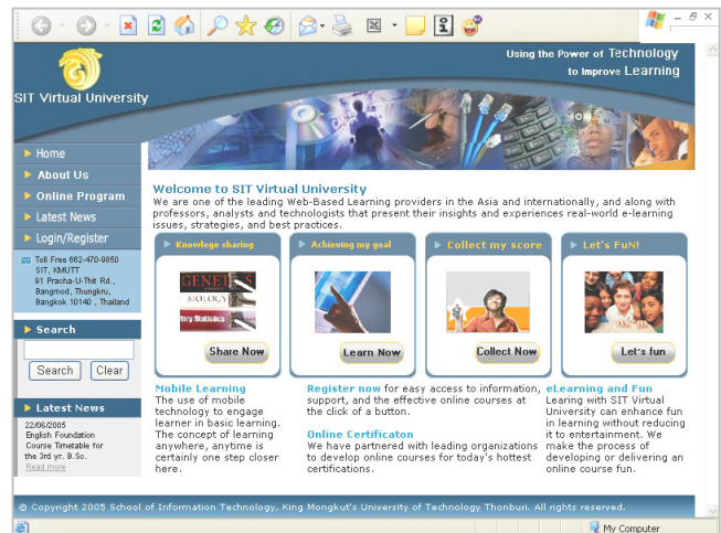
Fig. 3 An example WBL homepage

Samples of this research were composed of urban learners. Most of urban learners are IT-literate user, frequently use, and have easy to access WWW. Thus, it might limit the generalizability of the results. However, this study is the pilot of a larger scale study of not yet e-learning ready country. The next phase of data collection will gather from learners who are novice user and do not have easy access to WWW.