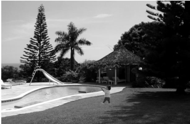
Fig. 2 Children detection

Simulation results that performed in Matlab simulink environment is presented in Figs. 2 and 3, figures represent base frame that is base of comparison consecutive frame that compared with base frame. In Addition edge detection block output in Fig. 3 is shown. Matrix in Fig. 4 shows final results [6].