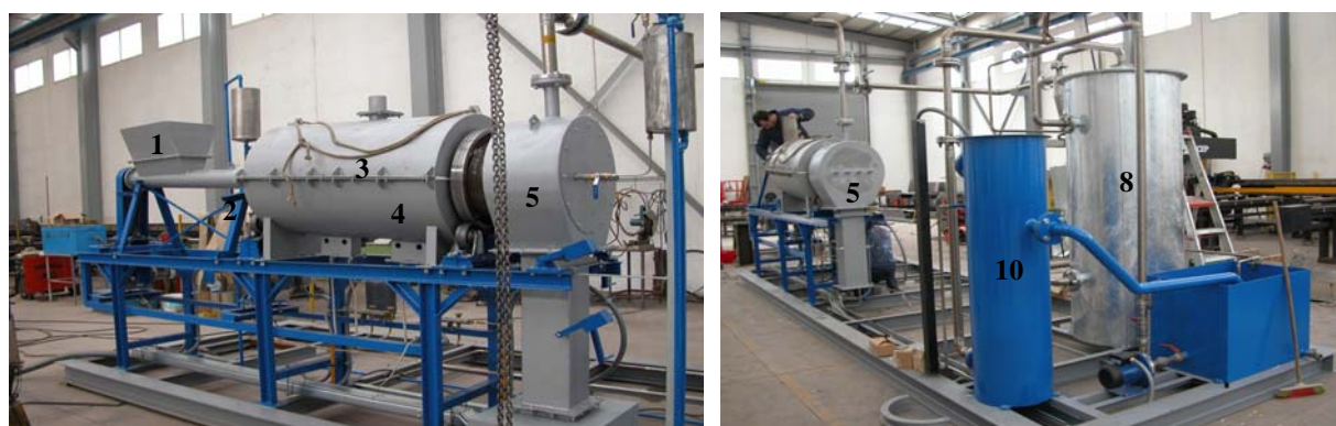
Fig. 2 Photographic views of the pilot plant (numbers are the same as Fig. 1)

Open Science Index, Environmental and Ecological Engineering Vol:6, No:12, 2012 publications.waset.org/10223.pdf