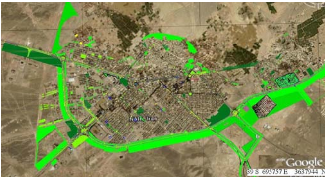
Fig. 3 Greenspace of Naein City in 2036 according to comprehensive plan of the city