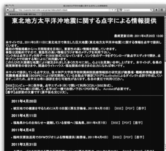
Fig. 3 Our portal site for the sufferers of Tōhoku earthquake and tsunami