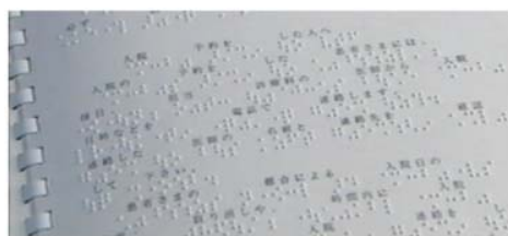
Fig. 2 Hospital brochures in braille and the example of printed page