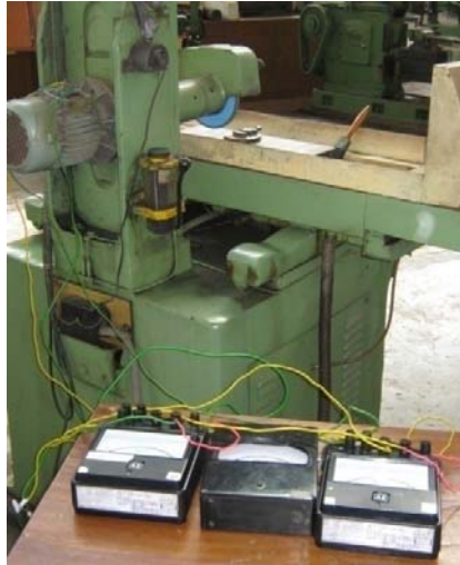
Fig. 1 Experimental setup