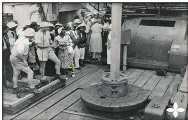
Fig. 1 Iho oil well [68]

Although the oil discovered in the study area was not in commercial quantity, it boosted Shell D'Arcy, promoting continuing oil exploration and exploitation in South-eastern Nigeria [32]. Nineteen years later, oil was discovered in commercial quantity in Oloibiri still within the study area but in present-day Bayelsa State, South-south region, after an estimated £40 million investment by Shell D'Arcy [33]. After this discovery, Nigeria shipped its first 5000 barrels of oil to the Shell Haven refinery in the United Kingdom, where the first-ever Nigerian oil was refined [34].