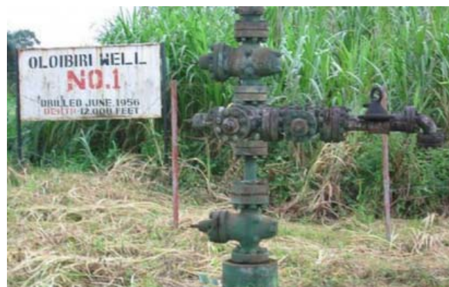
Fig. 2 Oloibiri oil well [67]

Although the oil discovered in the study area was not in commercial quantity, it boosted Shell D'Arcy, promoting continuing oil exploration and exploitation in South-eastern Nigeria [32]. Nineteen years later, oil was discovered in commercial quantity in Oloibiri still within the study area but in present-day Bayelsa State, South-south region, after an estimated £40 million investment by Shell D'Arcy [33]. After this discovery, Nigeria shipped its first 5000 barrels of oil to the Shell Haven refinery in the United Kingdom, where the first-ever Nigerian oil was refined [34].