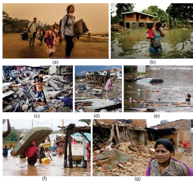
Fig. 2 Some pictures collected from social media and international broadcaster: (a) Australia bushfires (2020), (b) Philippines flood (2015), (c) Indonesia tsunami (2004), (d) Florida hurricane Michael (2018), (e) Germany flood (2021), (f) Niger flood(2020), (g) Nepal earthquake (2015)

damaging and needs to be taken into proper consideration.