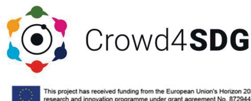
Fig. 1 Crowd4SDG is a three-year Horizon 2020 Research and Innovation Action; it is supported by the European Commission's Science with and for Society (SwafS) programme [6]