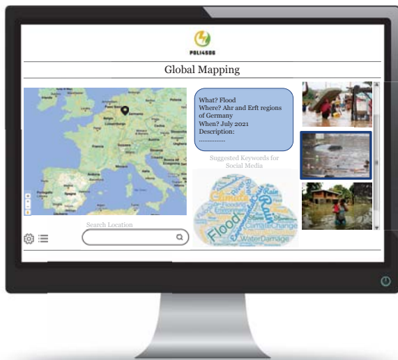
Fig. 4 Web Application Mockup of global mapping page of POLI4SDG

(see Fig. 5). For the web application (see Fig. 4), the same layout style for the mobile Front End has been adopted. The user can select search for a specific location, select images of interest and read the detail of the corresponding event. A word cloud component is also provided to suggest keywords search on social media. From the POLI4SDG application mockups, the main functionalities can be derived. First, a new user can register as an individual but also as a group. Hence, both companies and climate activist associations can register to the application. Furthermore, it is expected that other social media account will be connected. The association with other social network accounts is foreseen. This allows to exploit already existing networks and to eventually spread POLI4SDG across