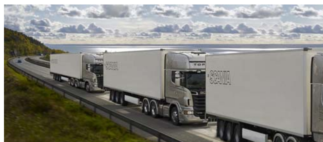
Fig. 1 Illustration of a three-truck platoon [1]

existing related studies mainly fall into two categories: one is the technical aspects of platooning, such as adaptive cruise control, safe driving, and automation technology for platoons [3]-[7]; the other concerns field tests to identify the factors influencing the fuel-saving effects [8], [9].