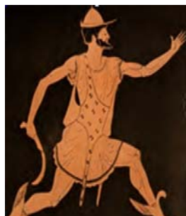
Fig. 1 Perseus and Sickle

terrified. Astyages gave his daughter to Cambyses, and he kept his value below the material middle classes. In their first year of marriage, Astyages had a second dream of a daughter growing up in the vine tree, which encompasses all of Asia, and her dreamers interpreted that her granddaughter would take her place. To prevent this from happening, he left the responsibility of killing him to a member of his family named Harpagus [67, p.139].