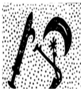
Fig. 3 Sickle as the Persian Symbol