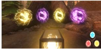
(a) Conveyance (Mind)