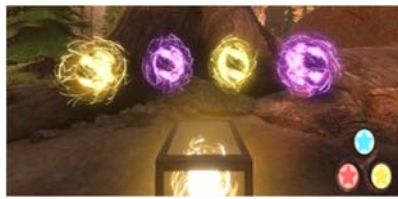
(a) Conveyance (Mind)