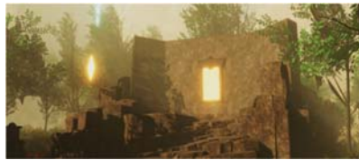
(b) Mirror (Soul)