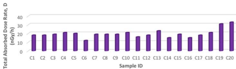
Fig. 2 Distribution of total absorbed dose rate in ceramic samples

are within the world average limit of 0.3 mSv for a safe dose. The variation of D values through all samples can be seen also from Fig. 2.