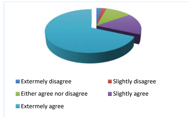
Fig. 2 The development of Iraqi cities by sustainable methods