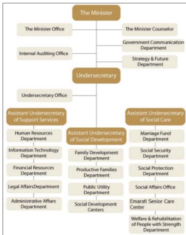
Fig. 2 Organisational Chart [27]

Another essential observation for this study is the importance given this Ministry. Again, according to the Vice-President “the dossier of government development and preparation for the future is given a great attention and tops the government’s list of priorities for the next phase” [26].