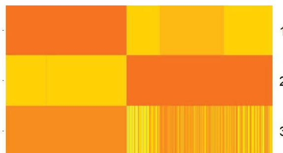
Fig. 3 Weight matrix W_1 by DNMF

The left half of the weighted matrix is for PayPay users, and the right half is for LINE Pay users. The darker the color, the higher is the degree of affiliation.