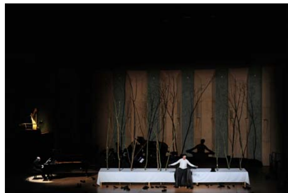
Fig. 9 Michael Borremans' Winterreise , 2014, stage performance

work whose publication does honour to the poet, the composer, and the publisher. Schubert has displayed a genius in his interpretation of the poet. He has truly appreciated the emotions expressed in these poems and reproduced them in music which none can sing or hear without being deeply moved [14].