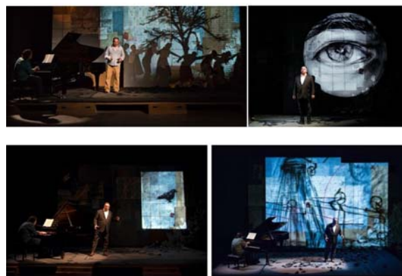
Fig. 7 William Kentridge, Winterreise , 2015, stage performance

characteristics, which established both Wilhelm Müller's text -narrated along the 24 poems, and the iconography, illustration held according the subject. William Kentridge conceived 24 ink drawings and collages to which gave movement, projected in a huge screen as 24 stop-action films. The technical procedure was similar to the ones the Artist usually applies in his video-installations and films. The Première happened at the Salzburg Festival in July 2014, with the baritone Matthias Goerne and the pianist Markus Hinterhäuser as leading figures.