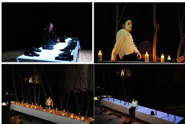
Fig. 8 Michael Borremans, Winterreise , 2014, stage performance