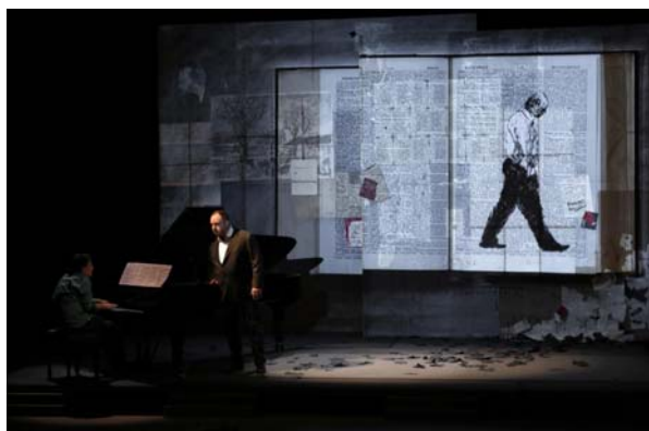
Fig. 10 William Kentridge, Winterreise , 2015, stage performance

Maybe the passionate effect of the singer performing on stage, the outcome of his overwhelming voice in a visual moving scenery leads to its crucial outcome. The whole environment increases reactions and passions towards a highest compulsive adherence. Maybe, all along these centuries, although the known differences in society, people still feel the pursued drama - loneliness, nostalgia, delusion and melancholy - with quite similar intensity (and urge).