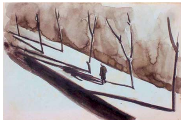
Fig. 3 Michael Borremans, Winterreise , 2014, painting

connaître le monde sans sortir de chez soi 1 [3].