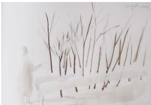
Fig. 5 Michael Borremans, Winterreise , 2014, painting

The aesthetic experiences are developed thru unexpected energies which emerge according to the empathies the artist or composer discovers. The process of creation implies research and emotions connected in harmony, accomplishing a journey the author wants to apply for. We could say that almost every artistic creation develops from a winter journey [ Winterreise ], as an ultimate journey that leads and – at in parallel - runs against dead and oblivion.