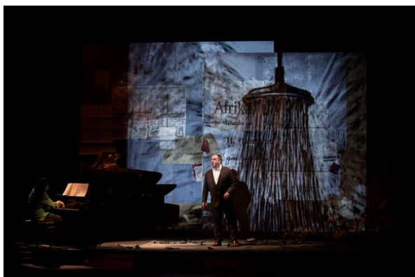
Fig. 1 William Kentridge, Winterreise , 2015

The South African artist, in an interview for the New York Times , said: “This “Winterreise” is a “celebration of incomprehension,” a defense of the “half-understood” [2]. Nothing is only what it seems to be. William Kentridge was seduced by German Lieder since childhood though he did not understand the language. He was compelled by the composition and – when invited to create his version – recovered his childhood memories and turned it into black and white images produced in a cinematic mood for the stage performance.