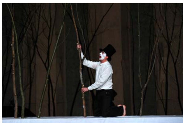
Fig. 6 Michael Borremans, Winterreise , 2014, stage performance

Borremans overcame as a genius. The visual imagery (and iconography) he created for Winterreise had its première in 2014, a production of the Muziektheater Transparant and Ensemble Intercontemporain for the Klara Festival, Bozar, Cité de la musique, in Belgium. The Belgian Artist presented a powerful Winterreise , creating scenery and wardrobe and set it on stage as though he was making an overwhelming installation, a grand and crucial Umwelt . Borremans' production was so huge and moving that the public would like to jump into transcendence and ensure a lap over human existence. When looking at the video registration of the Première , we immediately notice the intensity of two presences – the singer and the pianist are absolute. They dome with perfection their technique and conduct us – as viewers and spectators – towards a realm where chronology as no meaning and ensures all the possible contents of inner-consciousness.