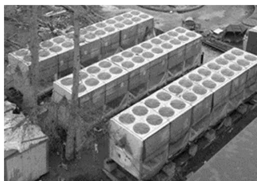
Fig. 1 Chillers under study

The proposed system is the mechanical system of a 540-bed hospital in Mashhad city with three air-cooled chiller as shown in Fig. 1.