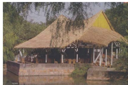
Fig. 7 The bamboo roofs of the Helou Pavilion [10]

Feng Jizhong's Square Pagoda Garden rejected the symbolism in form and the reproduction of the wooden structure, interpreting the tradition as an autonomous type of