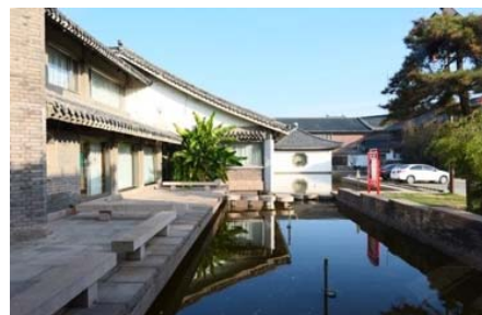
Fig. 9 The view to the east of the entrance of Queli Hotel

The layout of the public area of the Queli Hotel borrows the form of Chinese traditional garden, which reveals the resistance to symmetry and order. In the three core spaces of the foyer, dining room and meeting room, the four central columns at the ceiling level and the walls on the four sides constitute a centralized main space, divided into two groups which are connected on different axes with a transitional space in the middle, and they form into a cross-shaped plane centered on the foyer. Due to the complexity of the plane function, the functional volume that "overflow" outside the ideal space unit tends to present the form of "appendage" [8] in the formal composition (Fig. 10). The pool with gradient changes at the entrance, the winding path beside the pool, and the hall and dining hall across the water, are a group of spatial images from the Chinese traditional garden. They enlarged the "overflow" effect of the small space and transformed it into an elaborate arrangement, so that it could satisfy Dai Nianci's assumption of a fan-shaped viewing effect in the southeast corner of the Hotel from the perspective of the west exit of Wumaci Street. Simultaneously, it is also a way to break the homogeneity of