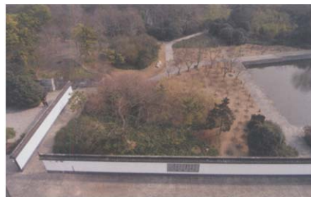
Fig. 11 The broken walls surrounding the pagoda courtyard [10]

making the building jump out of the traditional formula and produce unknown and flexible uncertainty.