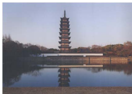
Fig. 13 The large white wall facing the water at the foot of the square tower [10]