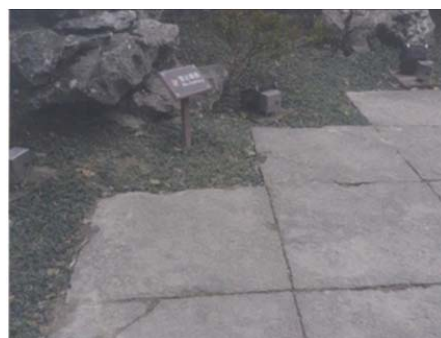
Fig. 12 The broken pavements in corners [10]