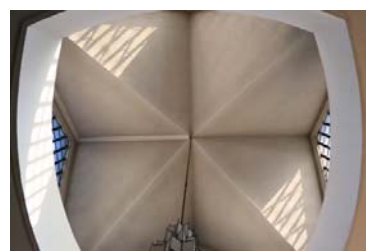
Fig. 2 Concrete folded-shell structure of Queli Hotel

The interpretation of meaning representation in form is more thoroughly reflected in the Xidan Market building in Beijing. The traditional roof (including the pillars) is abstracted, simplified and deformed, and reassembled as a form fragment or symbol placed in the middle of the facade to express the symbolism and metaphor of the "tradition". This approach avoids the premise constraint of structural rationality, separates the structural and spatial foundation of the traditional roof, and obtains support under postmodernism context. In fact, in such a strong and metaphysical posture and narrative method, the roof breaks away from the artisan tradition and the spatial foundation of the traditional quadrangle courtyard. It is reduced to a pattern or form fragment abandoning the practical operation and social attributes, a puzzle that satisfies the vision and association.