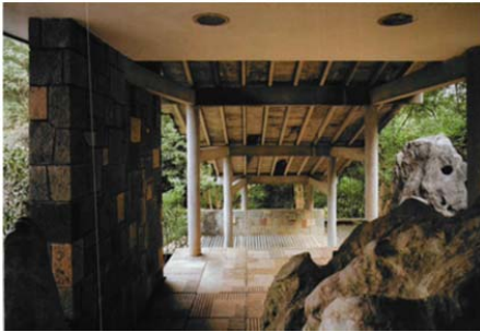
Fig. 4 The column-beam system of the roof and the multi-ribbed roof of the Xixi Scenery Spot Reception [3]