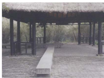
Fig. 14 The stone bench in the Bamboo Pavilion [10]

Square Pagoda Garden writes the "meaning" of the time with the spirit of nature, which guides the flow and transformation of space and provides an opportunity for the progression of the incident [1]. Nine arc walls of different heights, diameters, and