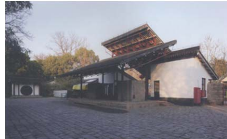
Fig. 6 The hip roof on the Square Pagoda Garden's north gate [10]