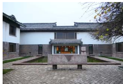
Fig. 8 The main courtyard in Guest room area of Queli Hotel

Even the positions of the plants in the courtyard have been carefully designed as part of the plane symmetry design. Although the Hotel takes the quadrangle courtyard as the prototype, it tends to adopt its shape in the passive response to its site and use, emphasizing the volume change of the building itself rather than the courtyard itself. There is a square green space surrounded by a circle of corridors in the courtyard, making it impossible to prepare for the narrative of time and events. In the self-sufficient and closed form, the sentiment and character of the traditional quadrangle courtyard have not been explored.