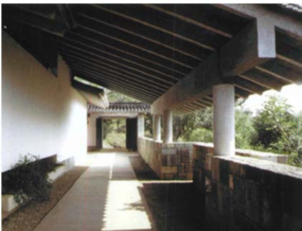
Fig. 5 The staggered roof at the entrance of the Xixi Scenery Spot Reception [3]