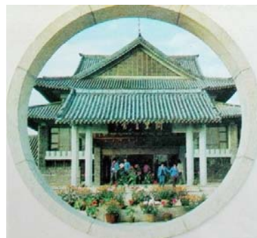
Fig. 1 The cross-ridge gable and hip roof with multiple eaves above the foyer of Queli Hotel Hata! Başvuru kaynağı bulunamadı.