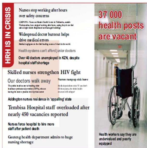
Fig. 2 Challenges Facing Human Resources for Health, adapted from [6]

The following section will give recommendations to the factors that contribute to data integrity issues and if applied can assist to manage data integrity challenges.