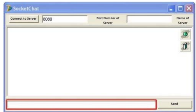
Fig. 6 Text sending by the user

TcpClient.Sendln (Encode (edSendText.Text);)