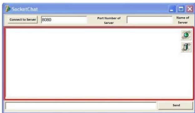
Fig. 5 File sending by the user

TcpClient.Sendln (Encode (edSendText.Text);)