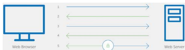
Fig. 1 The connection between the web browser and webserver using the SSL system [9]

security features to secure insecure application layer protocols such as HTTP and HTTPS. Based on that, cryptographic algorithms are applied to plain text that is supposed to pass through an insecure communication channel such as the Internet, and ensures that data are kept confidential throughout the transmission channel. An SSL certificate is required for a website to have a secure SSL connection. The connection between the web browser and webserver using the SSL system is shown in Fig. 1 [9].