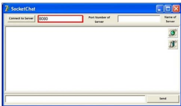
Fig. 3 The port number of the server