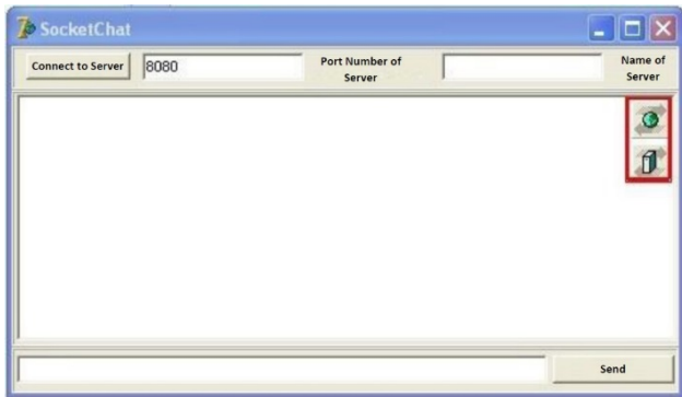
Fig. 2 The main dialogue box of the developed software

TObject;ClientSocket: TCustomIpClient; Begin