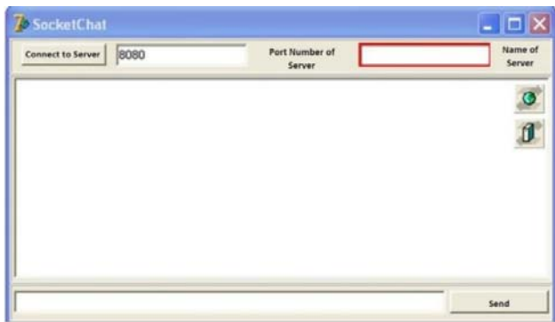
Fig. 4 The name of the server