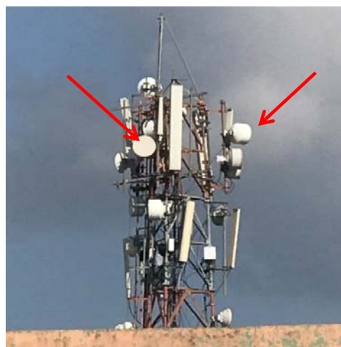
Fig. 1 A communication mast in Hyderabad, India; the microwave drum-like antennas, denoted by the arrows, were originally designed for communication needs and can constitute a built-in sensor network for environmental monitoring

Commercial MWLs operate at frequencies of tens of GHz and close to ground level, typically at elevations of tens of meters above the surface. These systems provide measurements of the Received Signal Level (RSL) at typically high temporal resolution (for example, every 15 minutes). The cellular providers typically store this standard data for quality of assurance needs. Weather conditions affect the signal strength of the wireless network and it can therefore be used as an environmental monitoring facility.