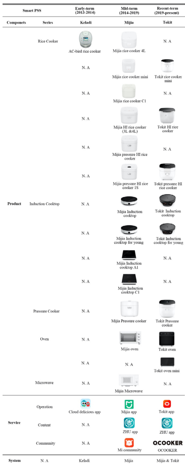
Fig. 2 Chunmi's Smart PSS