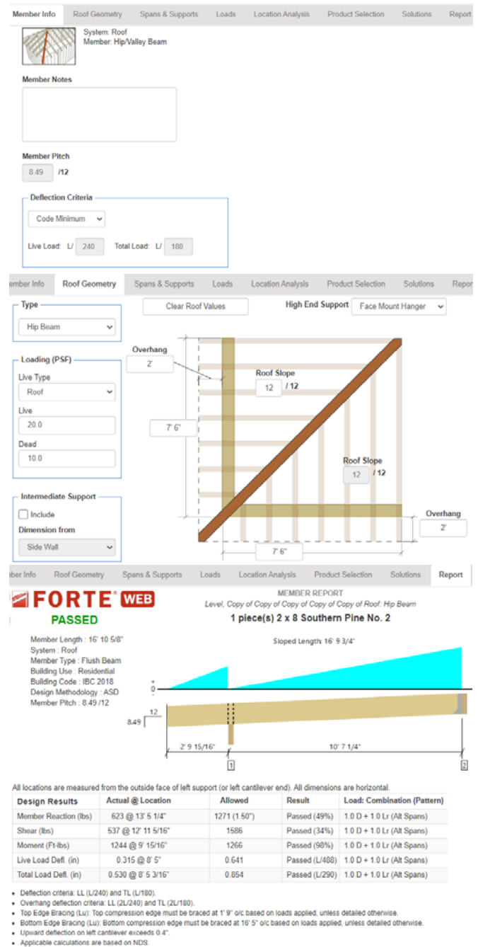
Fig. 1 Hip, shingle roof and 12/12 slope

The ForteWeb analyses for hip and valley members with a 12/12 slope which are loaded by shingle and tile roof are shown in Figs. 1 and 4. In the ForteWeb analysis, first the deflection criteria are assumed based on IRC 2018, which is L/240 for live load and L/180 for total load (L is length of the unbraced hip or valley). Second, the type of the roof, live load, dead load, overhang length, hip or valley unsupported length and slope of the roof are defined. Third, the member size and material type are picked up which is 2x8 Southern Pine No.2.