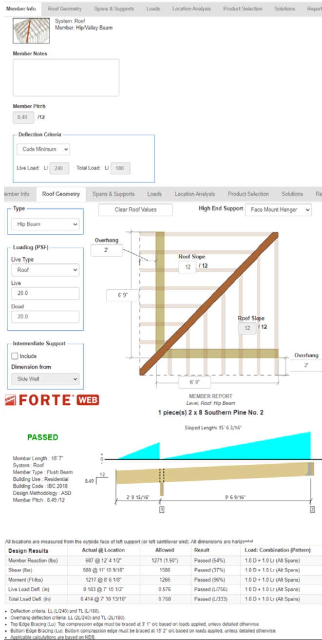
Fig. 2 Hip, tile roof and 12/12 slope

maximum clear unsupported length is calculated when the moment in hip and valley has approximately reached to 95% of capacity.