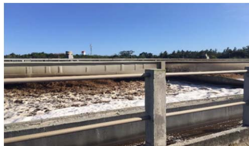
Fig. 1 Chemical effluent treatment station at CETREL

besides making possible the technical visits.