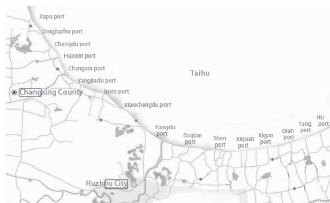
Fig. 5 The relationship between Lou Gang system of Taihu Lake and Huzhou City