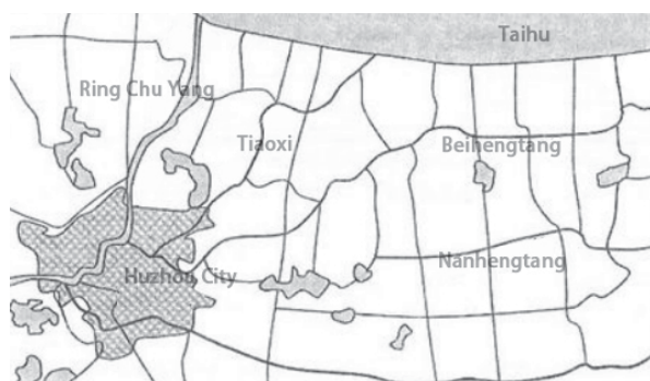
Fig. 2 Basic urban form layout of Huzhou