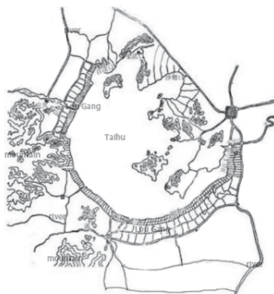
Fig. 3 Distribution of polder system in Lou Gang, Taihu Lake

thousand years of development, the Lou Gang polder system of Taihu Lake formed a mature water composed of the Taihu Lake dyke, the canal Hetang, the lake Lou Gang, several Hengtang and Wanqing polder fields in the Northern Song Dynasty Benefit system. The abundant water in Taihu Lake area flows to the land through Lou Gang and irrigates the Hangjiahu Plain area. Nowadays, most of the Lou Gang has disappeared due to lack of protection. Only the system of Lou Gang polder in Huzhou area has survived to this day, and it still has a fresh vitality. Lou Gang body of Taihu Lake is a combination of water conservancy, economy, ecology and culture. It has comprehensive functions of drainage, irrigation and navigation, and plays an important role in the world water conservancy system.