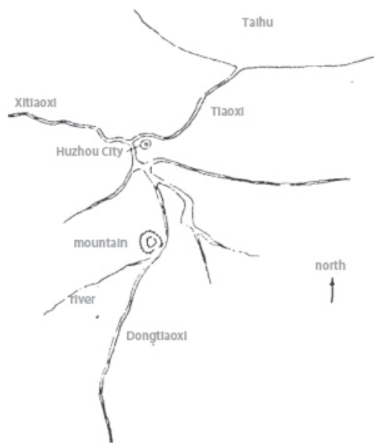
Fig. 1 Site selection of ancient Zicheng

has begun to have a water town in the south of the Yangtze River (Fig. 2).