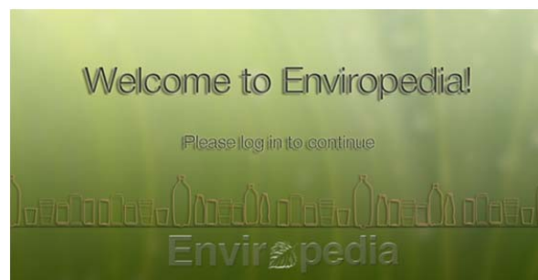
Fig. 1 Enviropedia front end

Initially, we chose to make both the game and the calculator focus on the carbon footprint associated with various beverage containers and their accessories (e.g. straws, sleeves, and lids). The carbon footprint for a beverage container is the amount of carbon dioxide (CO 2 ) that is emitted when fossil fuels are burned during the manufacture and transport of that object. This number is significant because CO 2 is the leading greenhouse gas contributing to global climate change. It is also a number that is easily calculated given the chemical composition of the fuel and the quantity that is consumed. Table I shows these carbon footprints (CO 2 output), measured in grams, which were collected from the SimaPro databases [26].