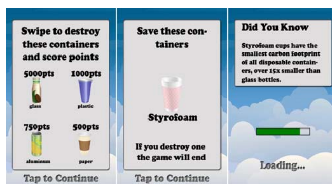
Fig. 5 Instructions for the stealth version of Container Chaos

Second, we created a "stealth" version where the educational objective is hidden. Here, the information is disguised as being all about the game. The "Loading" screen, which was unnecessary, gives players some time to digest the fact that Styrofoam has the smallest carbon footprint and glass has the largest (Fig. 5).