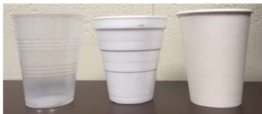
Fig. 7 Cups offered for taking refreshment

The university's Internal Review Board (IRB) determined that because no identifying information was being collected, this study did not constitute human subjects research, and therefore did not require IRB approval.