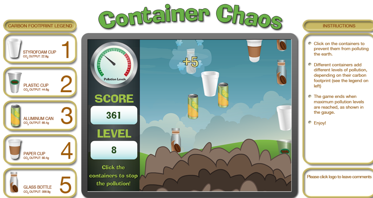
Fig. 2 Original version of Container Chaos on the web, during gameplay

about the impact that manufacturing and transporting various materials has on the environment. In this game, instant recognition of pro-environmental choices leads to higher scores. Container Chaos was developed using Adobe Flash, and therefore can be played on any device that supports the Flash Player. It is embedded in a webpage that explains the point system and rules and provides a link back to the other Enviropedia resources. Fig. 2 shows what the players see in their web browser while playing the game.