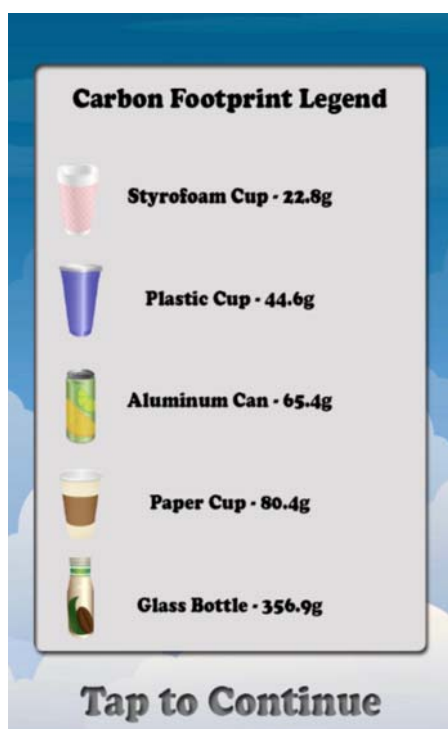
Fig. 4 Instructions for the educational version of Container Chaos