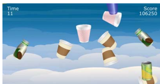
Fig. 3 Snapshot of mobile version of Container Chaos during gameplay

We found that the number of times that students played the game correlated closely with their overall engagement in the course, measured in terms of the average number of edits they made to the wiki, the number of words they wrote in their entries, and the numbers of comments that they left. It was interesting to see that learning (measured as the difference between pre- and post-test scores) increased for students with average levels of engagement, but stayed constant for students who were either minimally engaged or very engaged. It became clear to us that we needed to conduct a more rigorous experiment. We also needed to make Container Chaos more accessible (running on mobile devices) and more fun to play.