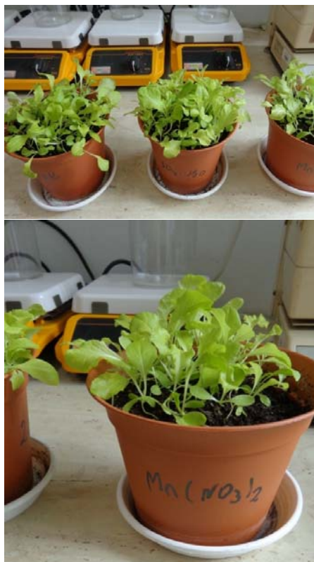
Fig. 2 An experiment of a Lettuce

Our plant research has been implemented of wetland soils based on the Colchis (Poti, Georgia) Agricultural-Ecological Experimental Station to explore the use of manganese-containing micronutrient produced from industrial waste for raising the fertility for chemical amelioration of wetland soils.